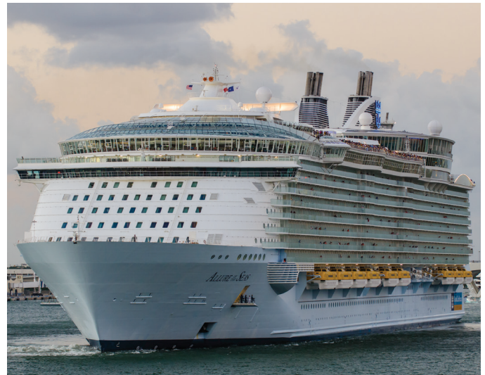
The Royal Caribbean cruise ship, the Allure of the Seas, equipped with a NAVIPILOT 4000