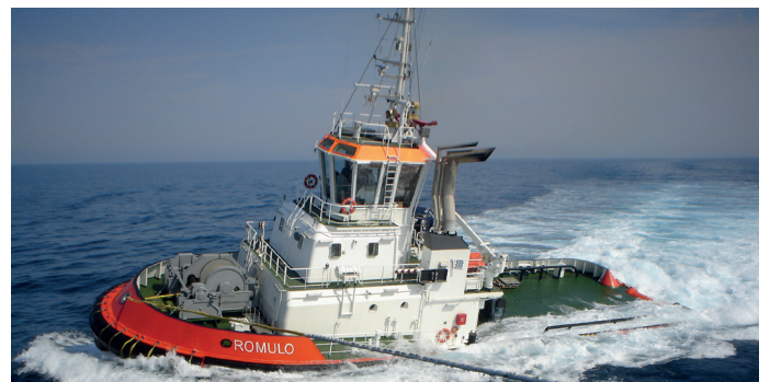
RED FOX (ROMULO) ESCORT TUG