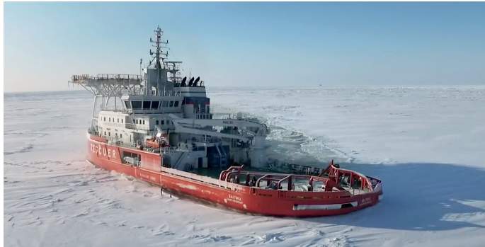
BALTIKA – OBLIQUE ICEBREAKER

Baltika with one-of-a-kind ARC104 design to break ice sideways