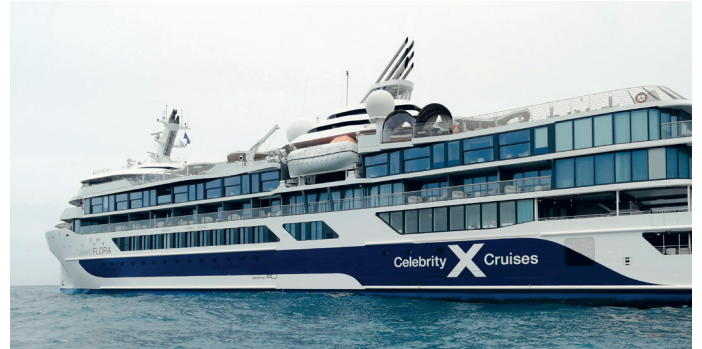
CELEBRITY FLORA – EXPEDITION MEGA YACHT