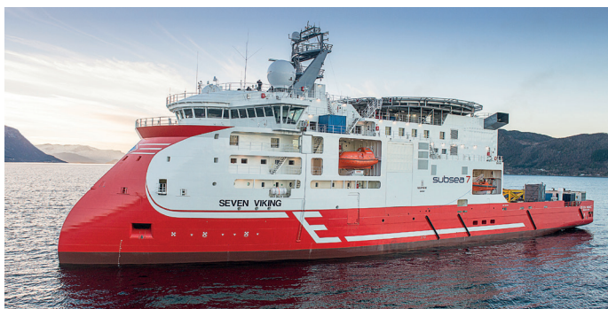
SEVEN VIKING – IMR VESSEL

Seven Viking – PSV offshore vessel Ship of the year in 2013