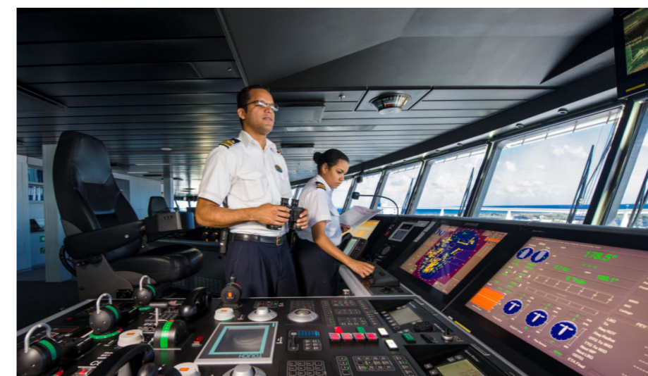
INTEGRATED NAVIGATION AND BRIDGE SYSTEMS FOR EASY OPERATION

Our NAVIKNOT Multi-sensor Speed Log series comprises a uniquely flexible range of speed log systems, for use on all types of vessels. We deliver Speed Logs from electromagnetic sensors, Doppler transducers to satellite sensors offering flexibility and to meet requirements for all types of vessels.