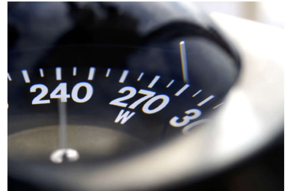
CHOOSE FROM A WIDE SELECTION OF MAGNETIC COMPASS SYSTEMS TO MATCH YOUR NEEDS

Our Autopilot and Steering Control systems include the NAVIGUIDE 4000,